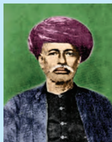
Mahatma Jyotirao Phule