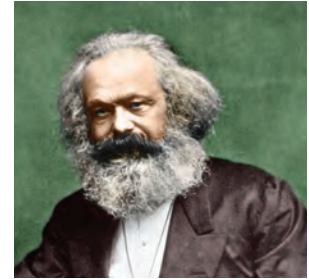
Karl Marx (1818-1883) A German Philosopher

Karl Marx considers the State as an instrument of exploitation of workers. This