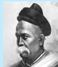
Justice Mahadev Govind Ranade

Focused on elimination of gender and caste discrimination.